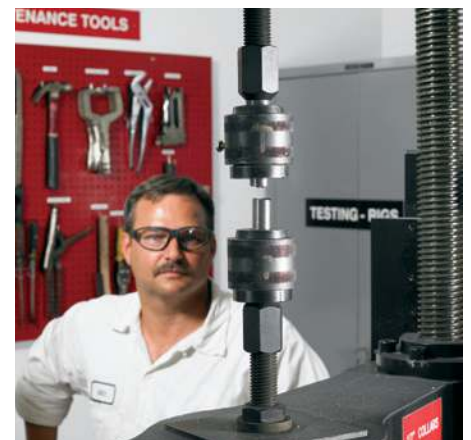
CISPI requires a tensile strength test, as shown, to be conducted every four hours to ensure iron quality.

Some engineers and contractors may wonder why CISPI has such a rigorous quality control inspection program. If they see the ASTM A74 or A888 marked on a piece of pipe, they may automatically assume that someone other than the manufacturer had inspected the material and verified compliance with the standard. That is simply not true. Contrary to popular belief, cast iron soil pipe products are not inspected by ASTM and the ASTM numbers that are typically marked on the products are not even required by the standards. Some importers of foreign-made cast iron pipe and fittings claim that third-party inspections of their plants are required by the code. That is also not the case. In fact, the standard has no requirement for third-party inspections. It clearly states that certification is the manufacturer's responsibility – the entity that poured the iron – and cannot be delegated to a seller or a third-party after the fact. ■