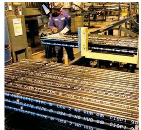
U.S. foundry shows pipe properly marked with country of origin, the name of the manufacturer, and the date it was produced.